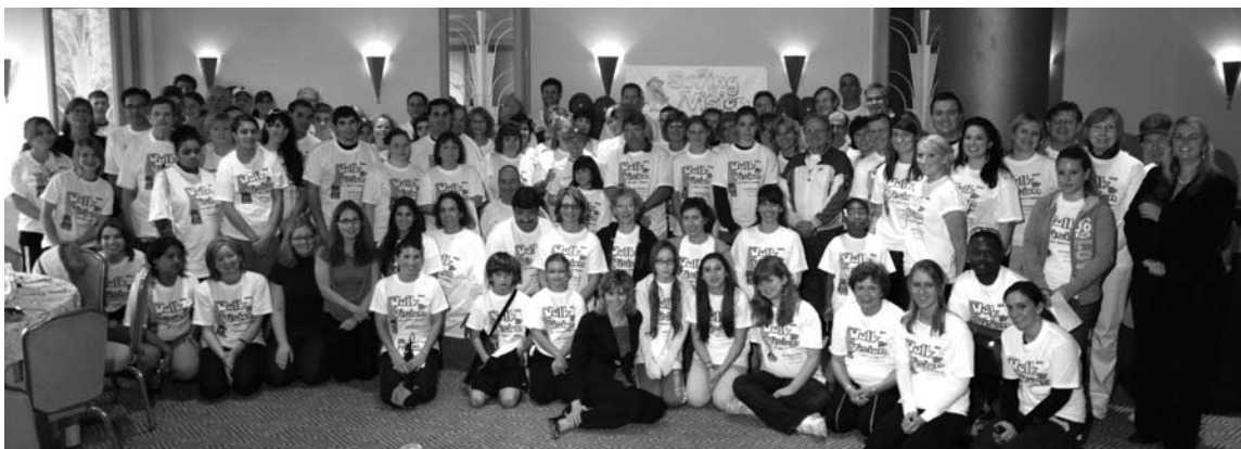
The Walk kicked off at the Royal Sonesta Hotel in Cambridge, MA and ended with a fun and educational program and a delicious lunch