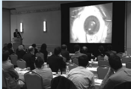
Physicians view presentations from colleagues