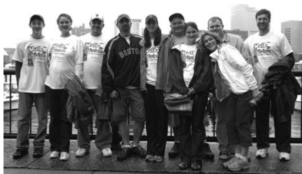
Walkers take time out for photo opportunity