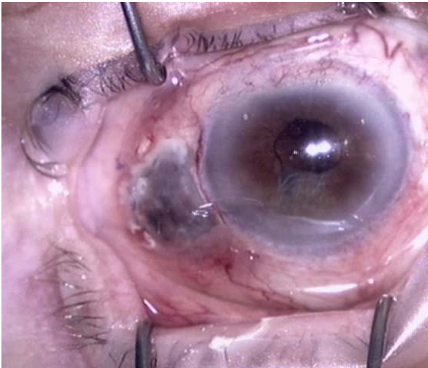
Figure 1. Preoperative photograph demonstrating large area of necrotizing scleritis.

A serologic examination for systemic causes of necrotizing scleritis was negative. The patient underwent scleral biopsy and patch grafting. Scleral biopsy cultures were negative; however, histopathologic examination disclosed branching filamentous fungi (Figure 2).